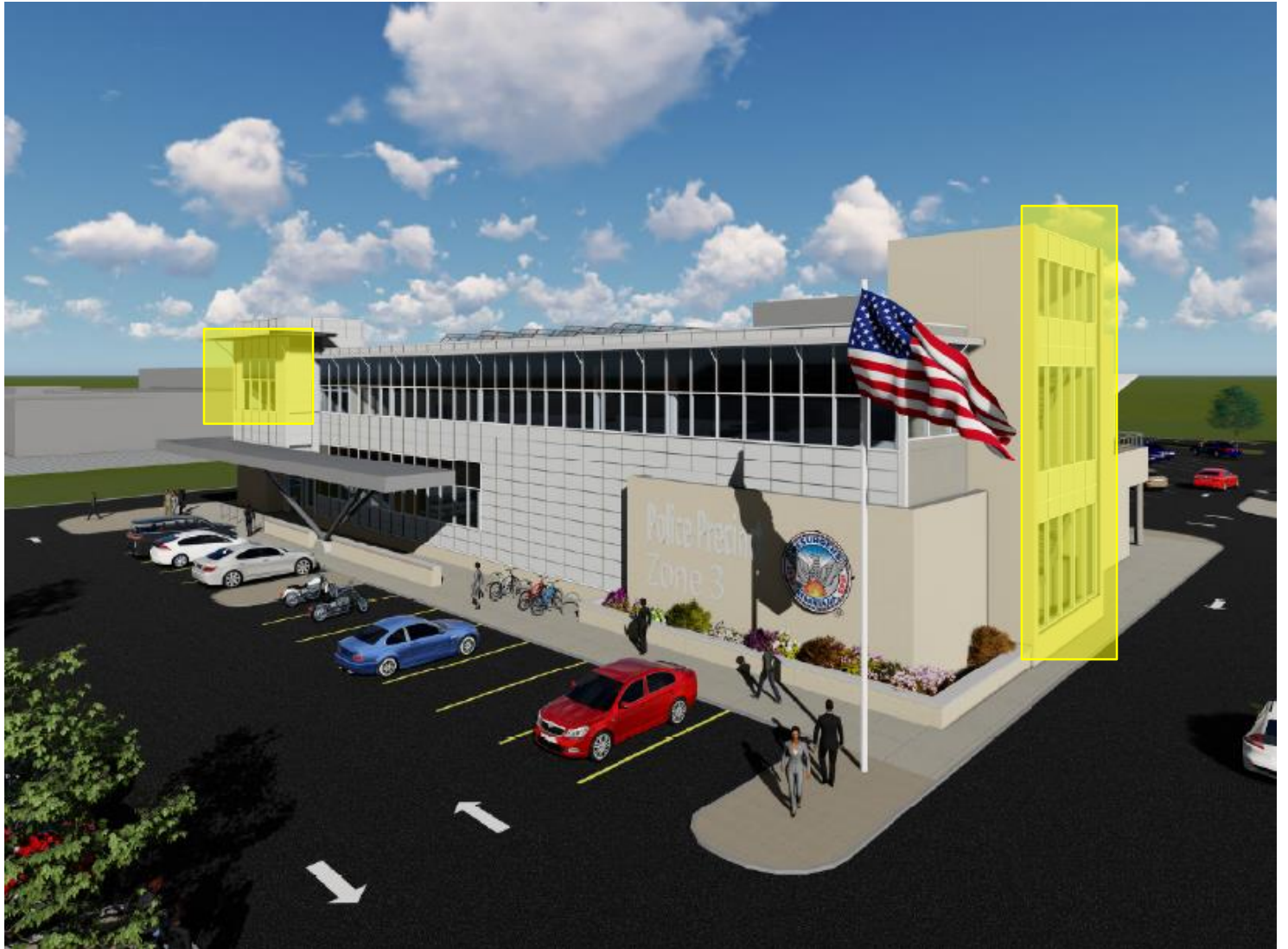
Rendering of exterior