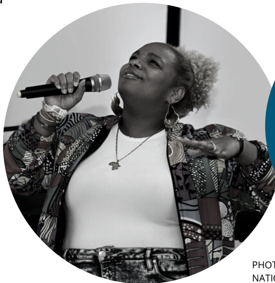
PHOTO COURTESY OF FY22 MSA GRANTEE NATIONAL BLACK ARTS FESTIVAL, INC. ELEMENTS OF HIP HOP