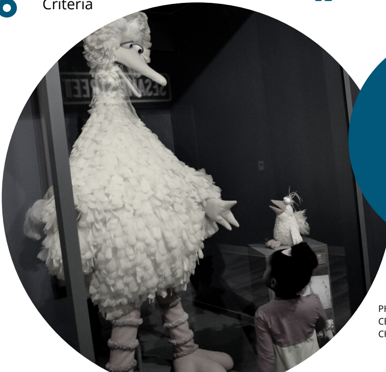
PHOTO COURTESY OF FY22 MSA GRANTEE CENTER FOR PUPPETRY ARTS, INC. CHILD ADMIRING BIG BIRD IN THE CENTER'S MUSEUM