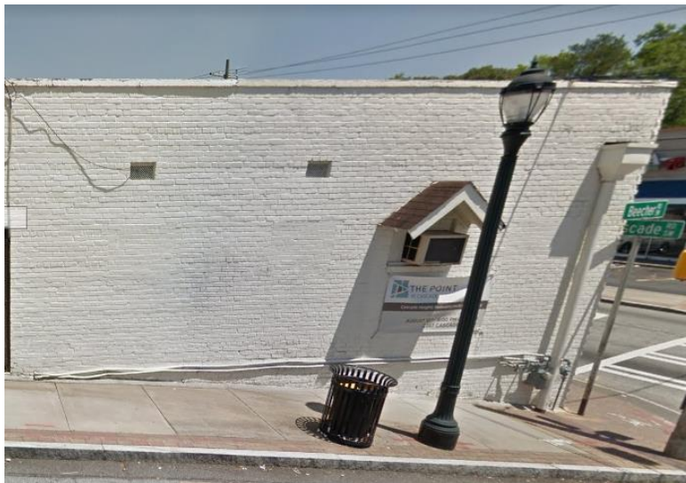
Wall D Beecher Street between Benjamin E Mays and Cascade $2500 stipend for artist fee and materials