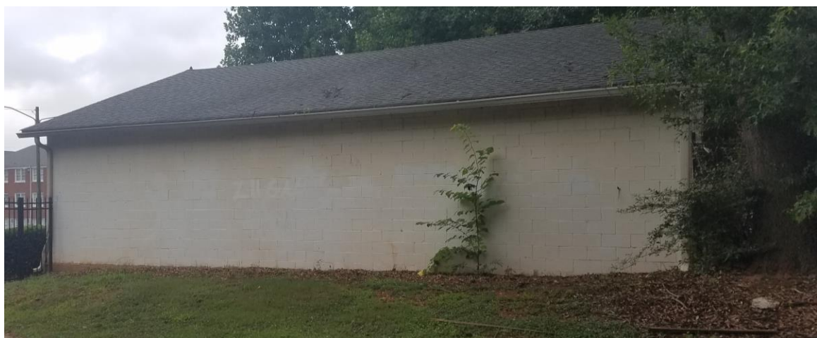
Wall B Herring Road $2500 stipend for artist fee and materials.