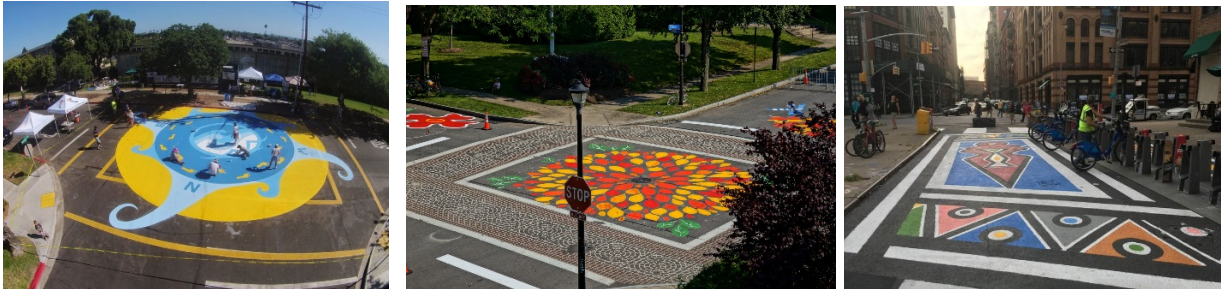
Examples of completed intersection murals

DCP, OCA and WEND are particularly interested in artwork that represents the spirit of the West End neighborhood, introduces color, and enhances the overall pedestrian experience.